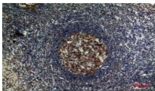
Immunohistochemical analysis of paraffin-embedded human-tonsilla, antibody was diluted at 1:100.